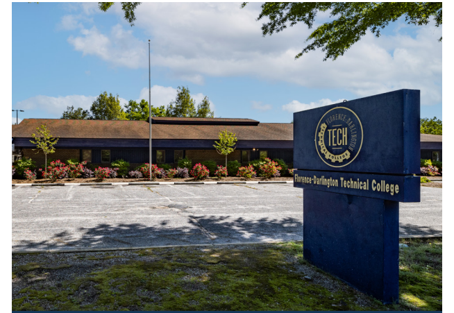
Hartsville Campus 225 Swift Creek Road, Hartsville