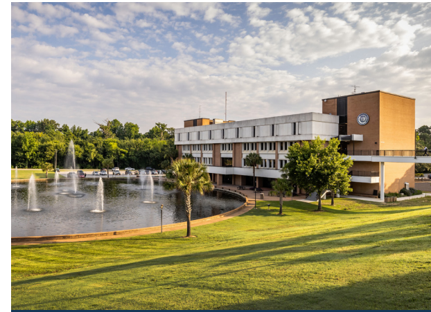
Main Campus 2715 West Lucas Street, Florence