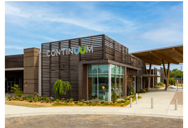
FDTC at the Continuum 208 West Main Street, Lake City