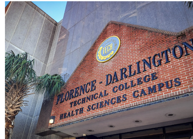
Health Sciences Campus (HSC) 320 West Cheves Street, Florence